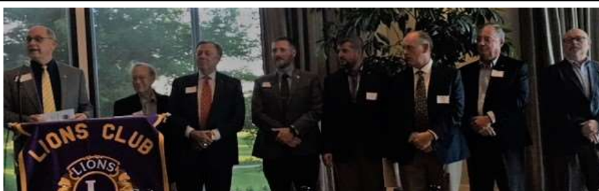
Figure 10 PID Anderson installed 8 of 12 Directors and Officers (2018-19)